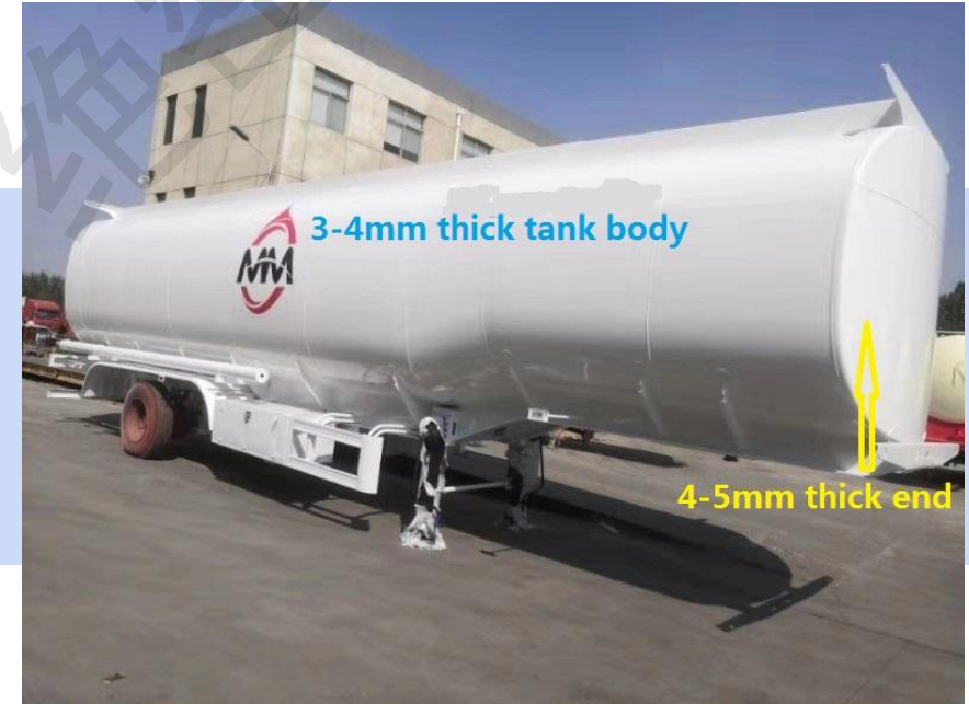
Other factories fuel tank trailer

Tank thickness is 4mm, and end plate is 5mm, to save cost, but durability is not sure when use.