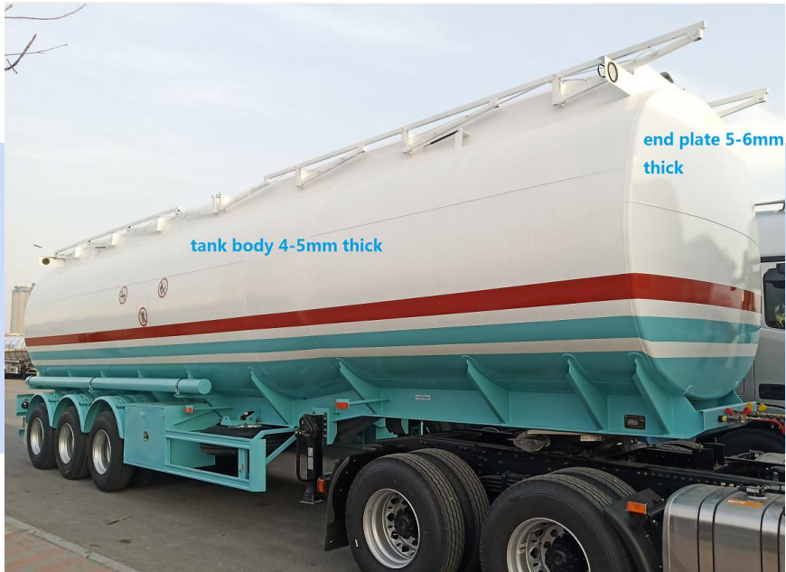
ZW fuel tank trailer

Tank thickness is 5mm, both end plate is 6mm thick. Thicker tank is strong enough to use for longer time.